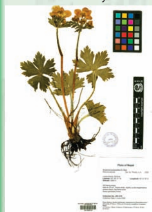
Anemone polyanthes -herbrium

Established in 1961 as a full government undertaking, the Botanical Survey and Herbarium - now called as National Herbarium and Plant Laboratories (NHPL) aims to support the nation building through R&D on the diverse plant resources of the country. This is the