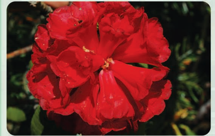
Rhododendron thomsonii Hook. f.