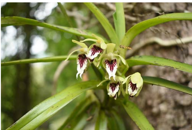
Figure 1. Study species Vanda cristata Wall. ex Lindl.

Vanda cristata is the perennial epiphytic orchid first collected in 1818 AD by Nathaniel Wallich in Nepal and described by John Lindley in 1832. It is distributed in Bhutan, Nepal, India, N. Vietnam, Thailand, Myanmar, Bangladesh and China (geographical distribution) (Roskov et al., 2019). In Nepal, it is distributed in Central and Eastern Nepal from 920 m to 2300 m (Rajbhandari & Rai, 2017). It is monopodial epiphytic orchid (holo-epiphyte) with yellowish-green fragrant flowers (Figure 1). Single inflorescence can produce 1 to 3 flowers and usually 1 or rarely 2 healthy pods. Flowers are thickly textured with wide openings. Petals are falcate, lip golden yellow to white, three-lobed and spurred. This species loves middle and lower trunks of host trees. Flowering time of V. cristata is from May to July.